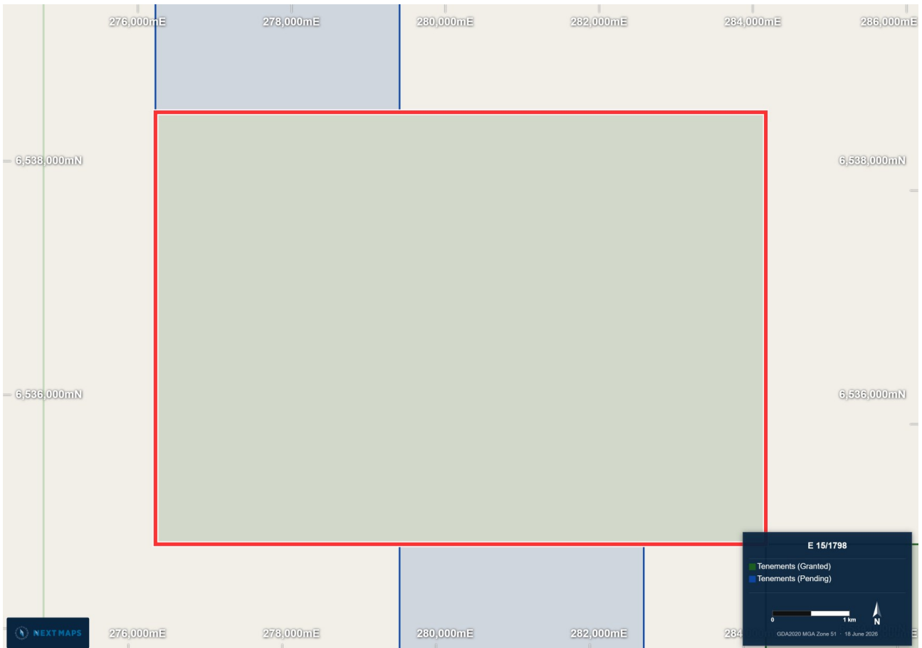
Tenement location map